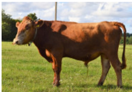
30359 NAPOKS-JERNAK 30359