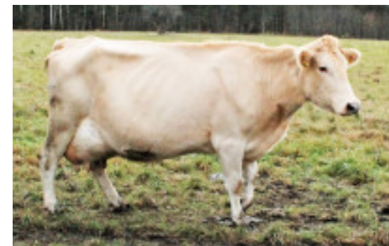
MANI 17432092 EK17432092A