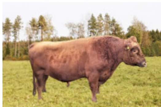
30375 NAPOKSJERNÄK 30375