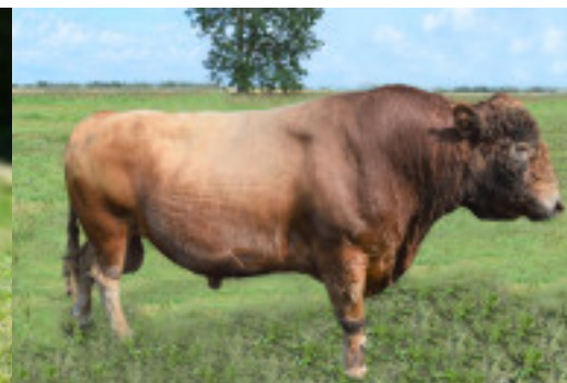
30334 OTINUMMI 30334