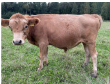
30418 NULLAK (LohuEnno) 30418